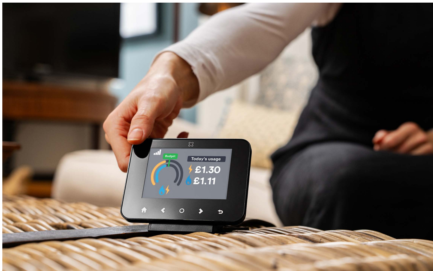
This image shows how a typical smart meter display looks. Smart meter display and figures are for illustrative purposes only.

If you rent, you may still be able to get a smart meter. If your energy bill is in your name, it's your choice to have a smart meter installed. It is recommended that you let your landlord know before you make the change.